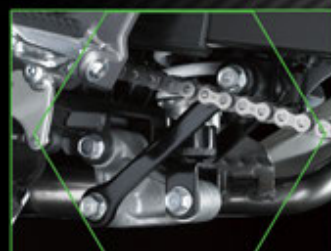
Uni-Trak rear suspension