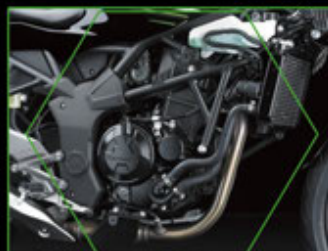
Fuel injection 4 T DOHC 250 cc single cylinder Liquid Cooler